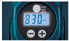
Digital pressure gauge provides high visibility with backlight.