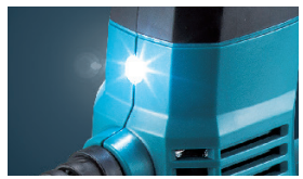
LED job Light for easy operation at dark places.