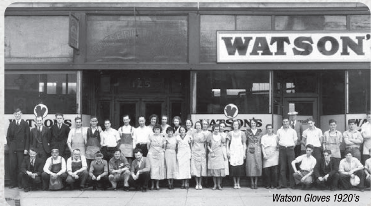
Watson Gloves 1920's